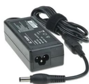
Alimentation DC 19V 16A

Bluetooth amplifier module. ..... LA-60AMP (code 02670)