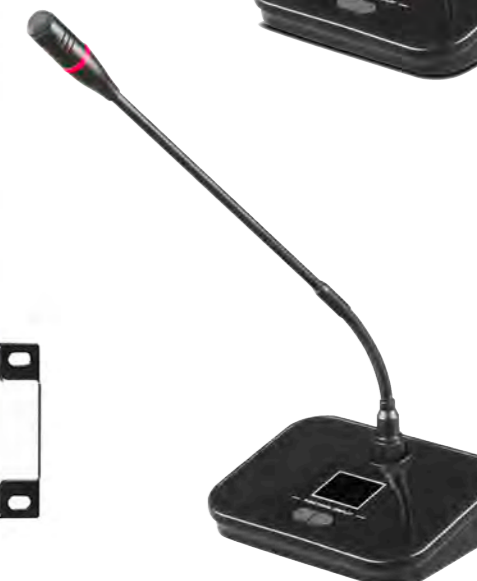
WDR69C Micro chair desk