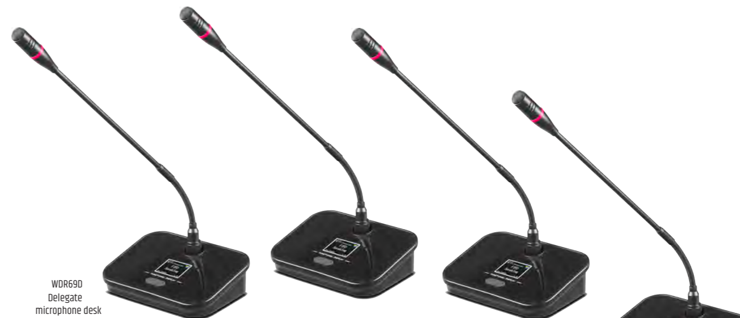
WDR69D Delegate microphone desk