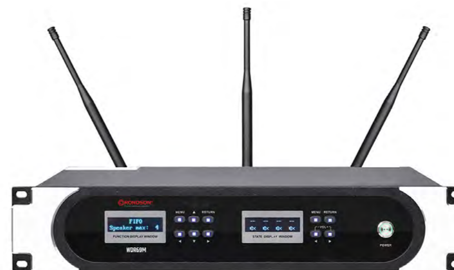
WDR69M Receiving station